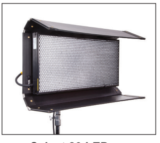
Select 20 LED