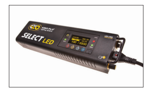
Select LED 150