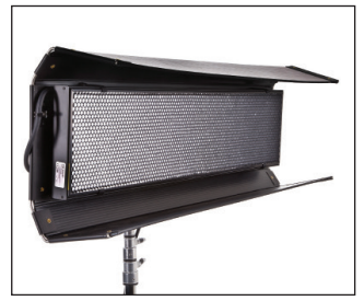
Select 30 LED