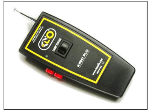
TST-LAMP Lamp Tester