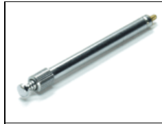
1160045 Ind-Antenna-19"-6- Sections