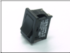
1290041 Rocker-SPST-MOM-4A- NO