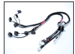
6260017 Tegra 4Bank Locking Harness