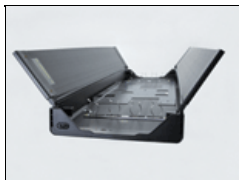
6650035 Tegra 4Bank Fixture Only