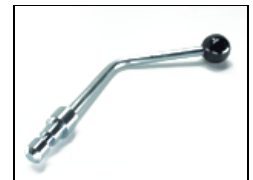
MTP-LJ Kino 41 Japan Baby Pin Lollipop