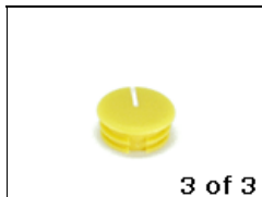
2240025 Knob Cap 14.5mm Yel w/Wht Line