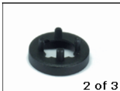
2240024 Knob Nut Cover 14.5mm Blk