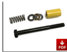
PRT-M11SY Kino #10 Mount Spacer w/ Spring Assembly