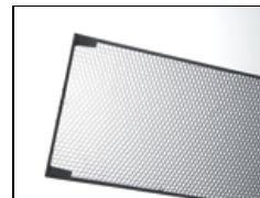
LVR-T490-P No longer available Tegra 4Bank Louver/HP, 90°