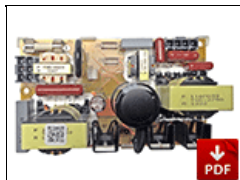
6800500 TG1 Tegra Ballast Board