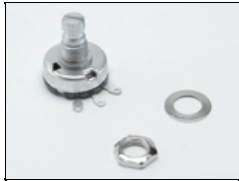
1060029 Resvar 50k 0.1W Lnr Panel Knurl