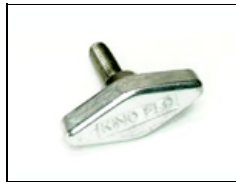
2240013 Knob T 3/8-16 X 1-1/4" ST ZI "Kino"