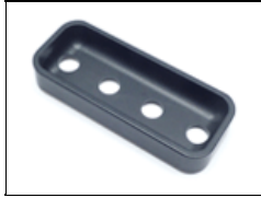
PRT-TEGS Tegra 4Bank Switch Guard