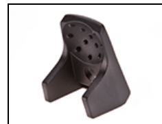
5260063 No longer available Kino Mount #10 Loose Jaw