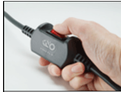
1230032 Power Cord-Inline Switch 16ft, 120vac