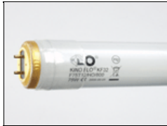
488-K32-S 4ft Kino KF32