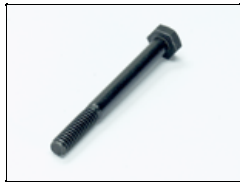
2010020 Bolt Hex-Head Steel 1/4- 20 X 2.75" BZ