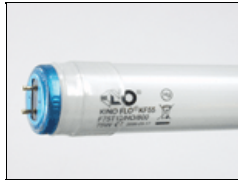
488-K55-S 4ft Kino KF55