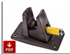
PRT-M10Y Kino #10 Mount Kit- Yellow