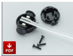
PRT-HLC Kino Locking Lamp Connector, 600V