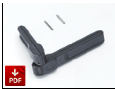
PRT-FIX-T4H Tegra 4Bank Hinge Repair