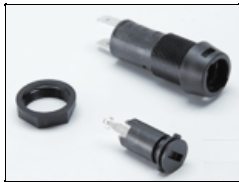
1320015 Fuseholder Screw Mount 5X20-0.187 Slot