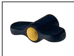
2240029 Knob T 1/4-20 #10 Kino Mount (wing)