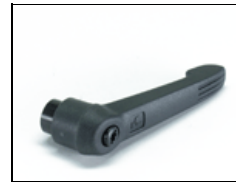
2240017 Knob Lever 1/4-20 X 2.56 /53 Series