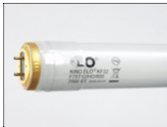
488-K32-S 4ft Kino KF32