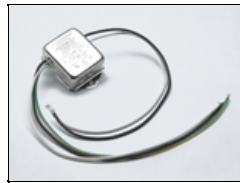
1170005 Filter EMI 4A 120/250VAC w/ Wires