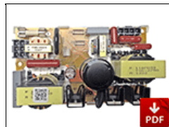
6800500 TG1 Tegra Ballast Board