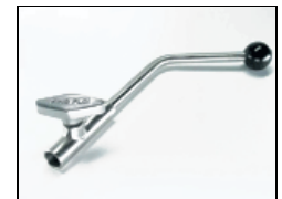
MTP-LB Kino 41 Lollipop w/ Baby Reciever (16mm)