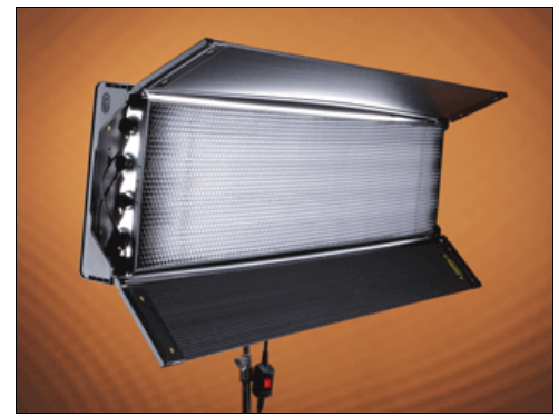
TEG-400-120U Tegra 4Bank, Univ 120U