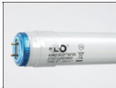
488-K55-S 4ft Kino KF55