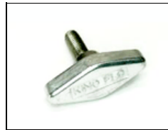
2240013 Knob T 3/8-16 X 1-1/4" ST ZI "Kino"