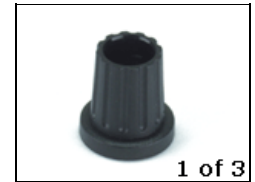
2240023 Knob Rnd Collet 6mm X 14.5mm Blk