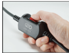
1230032 Power Cord-Inline Switch 16ft, 120vac