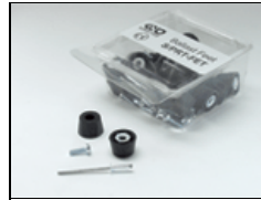
PRT-FET Ballast Feet (24pk)