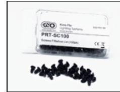
PRT-SC100 Screws F/Ballast Lid (100pk)