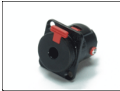
1270205 No longer available CT-Jack-Phone-1/4- Locking-Pnl-Blk