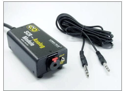
PWC-SCR-230 SCR Analog Dimmer, 230vac