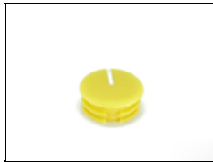
2240025 Knob Cap 14.5mm Yel w/ Wht Line