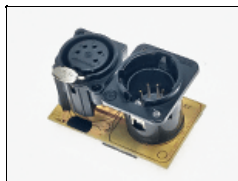
6800228 DMX Jacks - Isolated