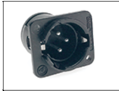
1270367 CT XLR Panel Male 3-Pin Cup