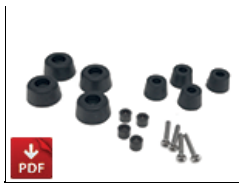
PRT-FET-L1 LED-151 Controller Feet (4pk)