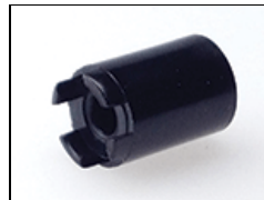
1290073 SW 5ESH965 Cap Black 15.0mm