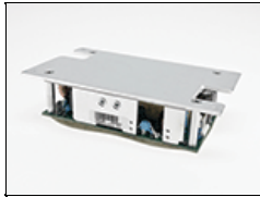
1180069 Power Supply 39V/240W 100/240VAC 3 x 5"