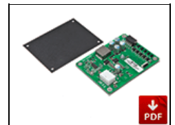
6820011 LED Driver 150W (Replaces 6800250)