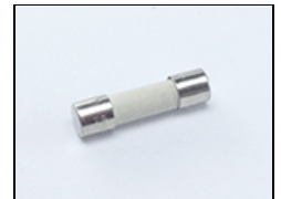
1300019 Fuse 5x20 Cer Slowblow 3.15A/250V for 1270383