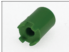
1290072 SW 5ESH965 Cap Green 15.0mm