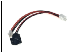
6110114 Select LED Controller DC/DC Harness 4-Pin