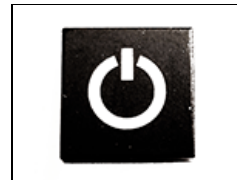
1290075 Switch Power Cap Only