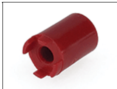
1290071 SW 5ESH965 Cap Red 15.0mm