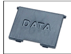
5160102 LED Control Bezel USB cover #2