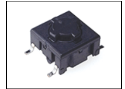
1290069 SW SPST 5ESH965 Base