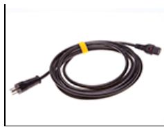
PWC-L12/120 IEC Lock Power Cable, 12ft 120VAC