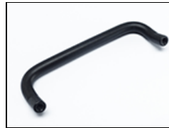
2250011 Handle D Offset 3" x 1" 6-32 Int Blk