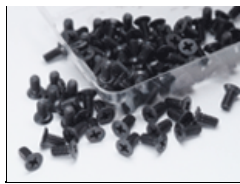
PRT-SC300 Screws for Ballast Lid (100PK)