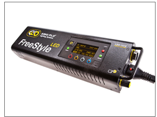
LED-151X-120U FreeStyle 151 LED DMX Controller, Univ 120U