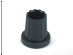
2240023 Knob Rnd Collet 6mm X 14.5mm Blk