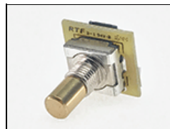
6800235 LED Encoder