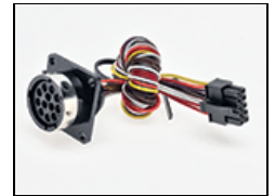
6110108 Select LED Controller Output Harness