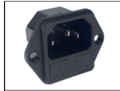
1270383 IEC Screw Inlet Fuseholder