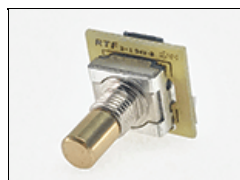
6800235 LED Encoder