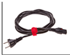
PWC-L12/230 IEC Lock Power Cable, 12ft 230VAC