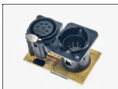
6800228 DMX Jacks - Isolated