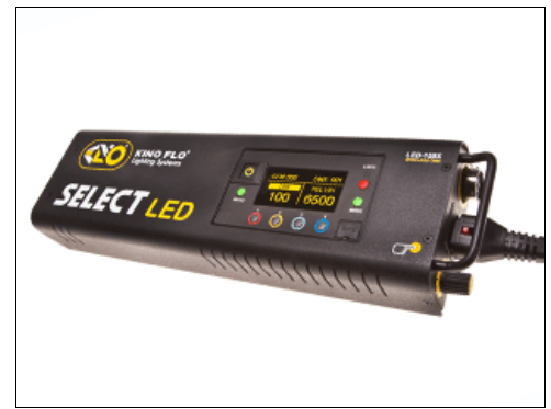
LED-150X-230U Select LED 150 DMX Controller, Univ 230U