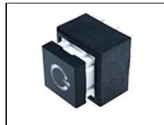
1290068 Switch SPDT Lit Red Green Graphic