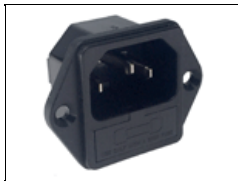
1270383 IEC Screw Inlet Fuseholder