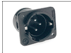
1270367 CT XLR Panel Male 3-Pin Cup