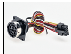
6110108 Select LED Controller Output Harness