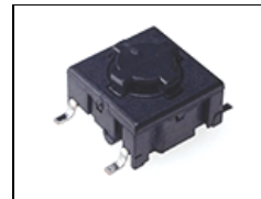
1290069 SW SPST 5ESH965 Base