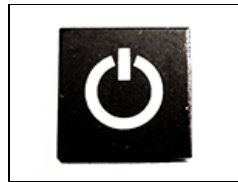
1290075 Switch Power Cap Only