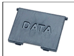
5160102 LED Control Bezel USB cover #2