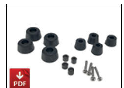
PRT-FET-L1 LED-150 Controller Feet (4pk)