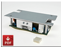
PRT-PWS-S39 Select 150X Power Supply Repair Kit