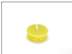
2240025 Knob Cap 14.5mm Yel w/ Wht Line