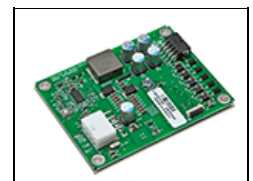
6820002 LED Driver 150W Version 3