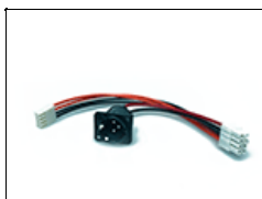
6110153 FreeStyle 140X Controller DC/DC Harness 4-Pin