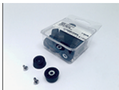
PRT-FET3 LED-140 Controller Feet (4pk)