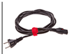
PWC-L12/230 IEC Lock Power Cable, 12ft 230VAC