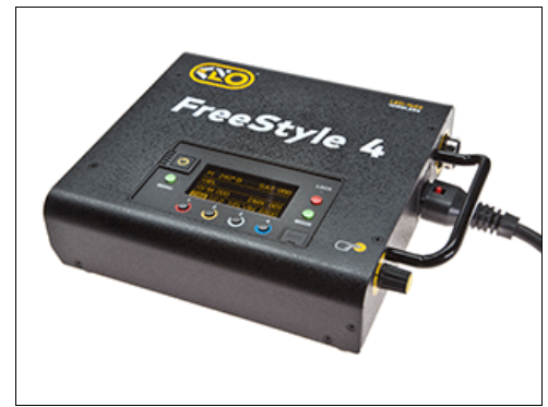
LED-140X-230U FreeStyle 140 LED DMX Controller, Univ 230U