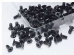
PRT-SC300 Screws for Ballast Lid (100PK)