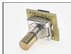
6800235 LED Encoder