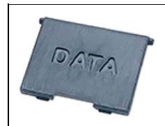
5160102 LED Control Bezel USB cover #2