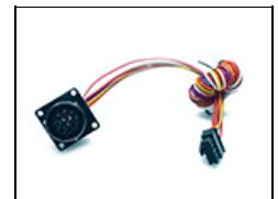
6110152 FreeStyle 140X Controller Output Harness