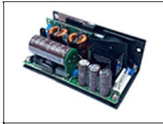
1180075 Power Supply 48V/225W 100/240VAC Non-L