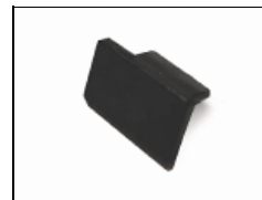
5160172 LED Control Bezel USB Rubber Plug