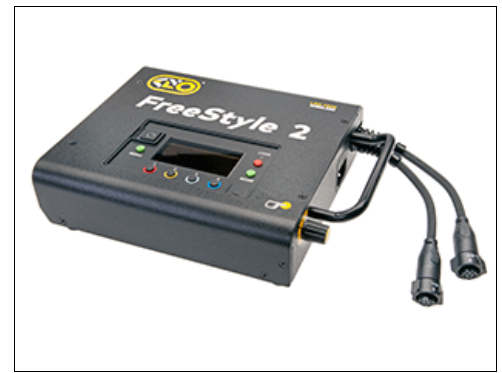
LED-120X-230U FreeStyle 230 LED DMX Controller, Univ 120U