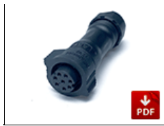
PRT-LXF100 X08-F125 Female Connector Assembly