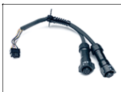
6110158 FreeStyle 120X Controller Output Tails