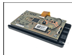
6800262 LED Controller w/ Timo Antenna