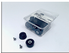
PRT-FET3 LED-120 Controller Feet (4pk)