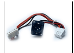
6110156 FreeStyle 120X Controller DC/DC Harness 6-Pin