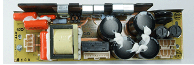
6800096 - VistaBeam 600/300 Ballast Board

2840 N. Hollywood Way Burbank, CA U.S.A. 91505-1023 Tel: +1 (818) 767-6528 Fax : +1 (818) 767-7517 www.kinoflo.com