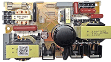
6800500 - TG1 Ballast Board

2840 N. Hollywood Way Burbank, CA U.S.A. 91505-1023 Tel: +1 (818) 767-6528 Fax : +1 (818) 767-7517 www.kinoflo.com