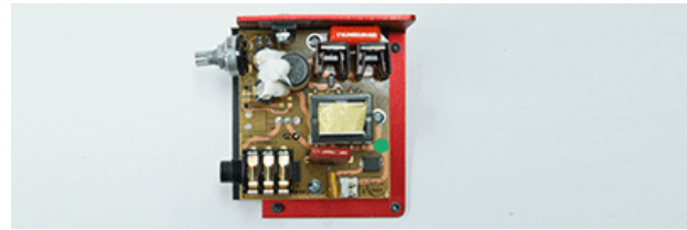
6800062 - Mini-Flo 239X Ballast Board

2840 N. Hollywood Way Burbank, CA U.S.A. 91505-1023 Tel: +1 (818) 767-6528 Fax : +1 (818) 767-7517 www.kinoflo.com