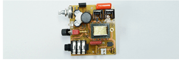
6800037 - Mini-Flo 139X Ballast Board

2840 N. Hollywood Way Burbank, CA U.S.A. 91505-1023 Tel: +1 (818) 767-6528 Fax : +1 (818) 767-7517 www.kinoflo.com