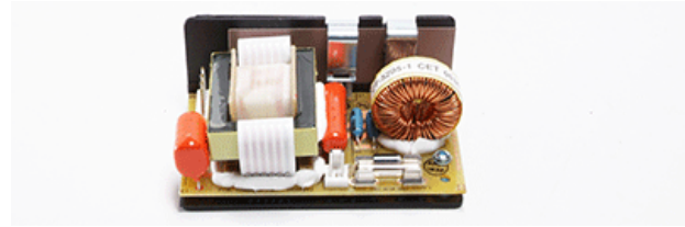
6800042 - 12V Single Ballast Board

2840 N. Hollywood Way Burbank, CA U.S.A. 91505-1023 Tel: +1 (818) 767-6528 Fax : +1 (818) 767-7517 www.kinoflo.com