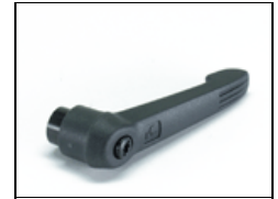
2240017 Knob Lever 1/4-20 X 2.56 /53 Series