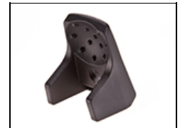
5260063 No longer available Kino Mount #10 Loose Jaw