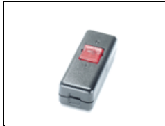
1290005 No longer available SW-Rocker-Inline-DPST- 10A-250V-Lit