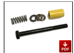
PRT-M11SY Kino #10 Mount Spacer w/ Spring Assembly