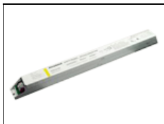
6610026 Compact QT 2X54W/120vac-Dim