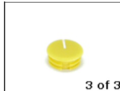
2240025 Knob Cap 14.5mm Yel w/ Wht Line