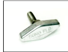
2240013 Knob T 3/8-16 X 1-1/4" ST ZI "Kino"