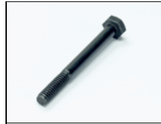
2010020 Bolt Hex-Head Steel 1/4- 20 X2.75" BZ