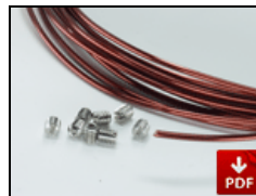
EXP-FXRS Fixture Wire Repair Kit Silver