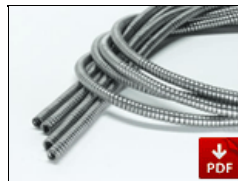
PRT-FHD2 Diva-Lite 201 Fixture Wire Channel Repair Kit/Silver