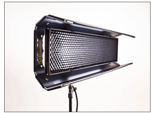
DIV-200-120/JP Diva-Lite 200, 120VAC Japan