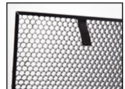
LVR-D290-P Diva-Lite 201 Louver/HP 90° (Replaces LVR-D2-S)