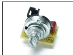
6800047 Diva Dimmer Board 120/230V