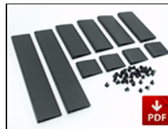
PRT-FIXD2 Diva-Lite 201 Fixture Wire Channel Repair Kit/Silver