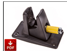
PRT-M10Y Kino #10 Mount Kit- Yellow