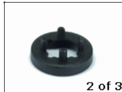
2240024 Knob Nut Cover 14.5mm Blk