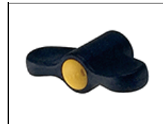
2240029 Knob T 1/4-20 #10 Kino Mount (wing)