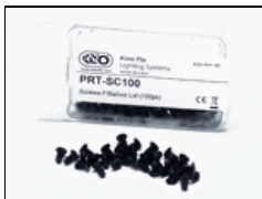
PRT-SC100 Screws F/Ballast Lid (100pk)