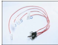
6110046 No longer available Select SW Assy BarFly 400