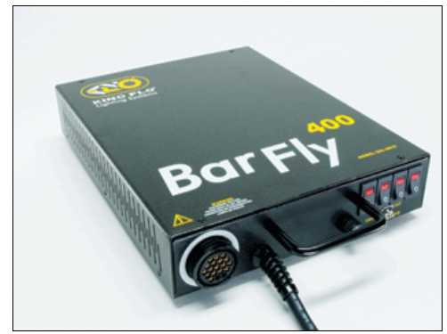
BAL-407-G230 BarFly 400G Ballast, 230vac