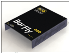
5190043 No longer available BarFly 400G 120/230V Lid