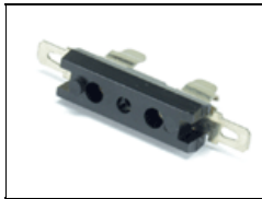
1320010 FUHLDR-Screw Mount- 5X20-0.187