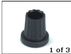
2240023 Knob Rnd Collet 6MM X 14.5mm Blk