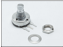
1060031 Resvar 5K 0.1W Lnr PCB Knurl