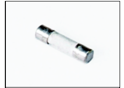
1300019 FU-5X20-CER-SloSlow- 3.15A/250V