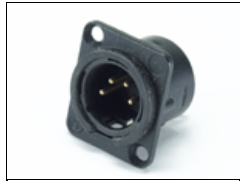
1270194 No longer available CT-XLR-Panel-Male-4-Pin