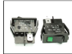
1290039 SW-Rocker-SPST-10A- 12V-Lit-Grn