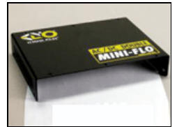
5050012 No longer available Mini-Flo 239 Double Ballast Lid