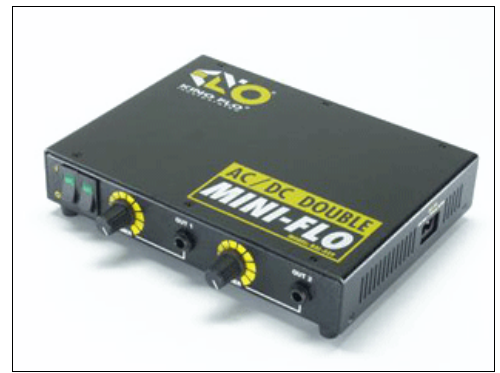
BAL-239/BAL-239X Mini-Flo Double Ballast, 12vdc w/ Universal VAC