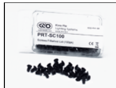
PRT-SC100 Screws F/Ballast Lid (100pk)