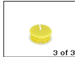
2240025 Knob Cap 14.5mm Yel w/ Wht Line