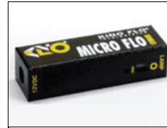
5060002 No longer available Micro-Flo Ballast Lid