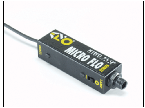
BAL-132 Micro-Flo Ballast, 12vdc