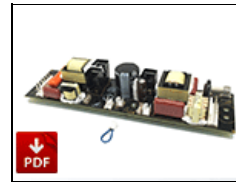
6800177 VG5R Ballast Board