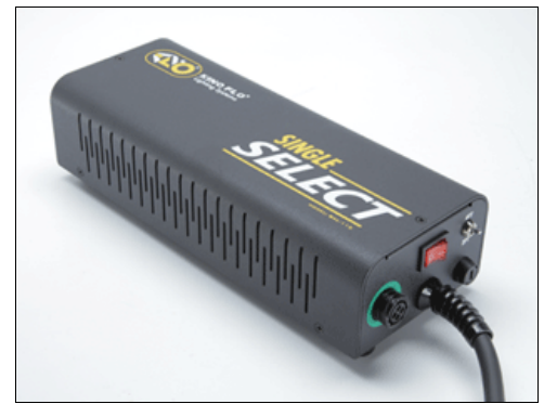
BAL-115-230 Select Single Ballast, 230vac