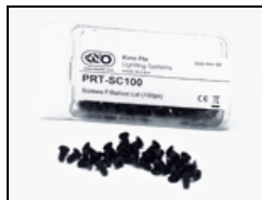
PRT-SC100 Screws F/Ballast Lid (100pk)