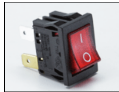
1290055 Switch Rocker Mini DPST 12A 250V