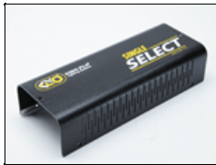
5000053 No longer available Select 115 Single 230V Lid