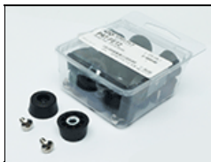
PRT-FET2 Ballast Feet (24pk)