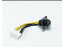
6110050 Single 120V/ 230V Ballast Lamp Wiring Assy