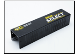
5000013 No longer available Select 105 Single 120V Lid