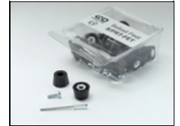
PRT-FET Ballast Feet (24pk)