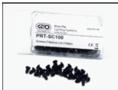
PRT-SC100 Screws F/Ballast Lid (100pk)