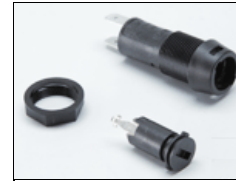
1320015 Fuseholder Screw Mount 5X20-0.187 Slot