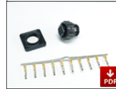
PRT-BX1 Single Ballast Connector Assy