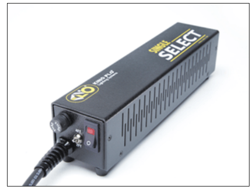
BAL-105-S100/JP Select Single Japan Ballast, 100vac