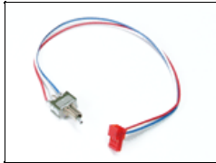
6110034 Select Switch Assembly Single 105