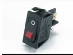
1290047 Switch-Rocker-DPST 16A- Lit-Red-125V