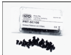
PRT-SC100 Screws F/Ballast Lid (100pk)