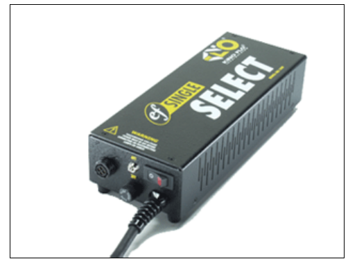
BAL-100-F230 Select/EF Single Ballast, 230vac