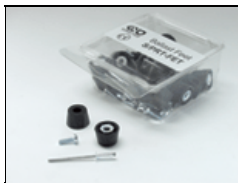
PRT-FET Ballast Feet (24pk)