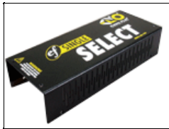
5000041 No longer available Select 100F Single 230V Lid