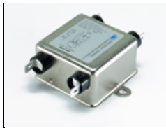
1170003 EMI Filter 5A-250V