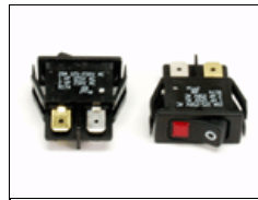
1290030 Switch-Rocker-DPST 16A-Lit-Red-250V