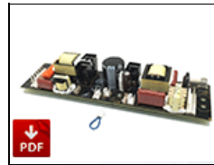
6800177 VG5R Ballast Board