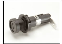
1320016 Fuseholder-Panel Mount 5X20-LoPro