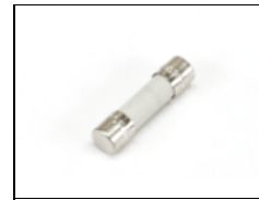
1300001 Fuse-5X20-Ceramic Sloblow-2A/250V for 1320016