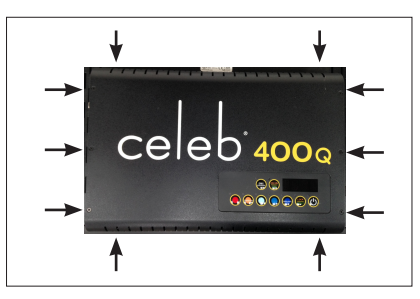
7) Re-install ten (10) cover screws.