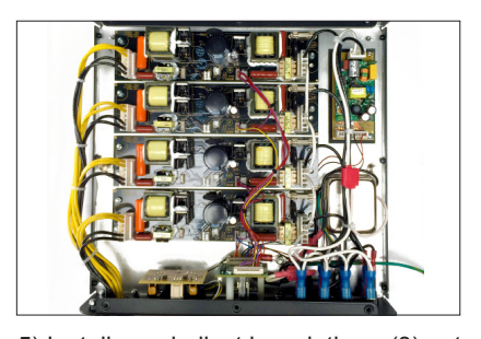
5) Install new ballast board, three (3) nuts, lamp output and DMX connectors. Then connect AC input connector.

4) Remove three (3) nuts and remove board.