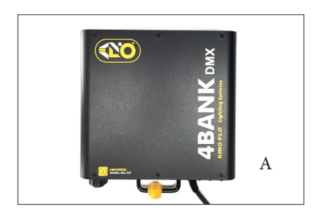
6) Install twelve (12) cover screws.

4) Remove three (3) nuts and remove board.