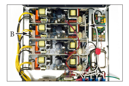
2) Remove AC input connector (A). Then remove lamp output connector (B).