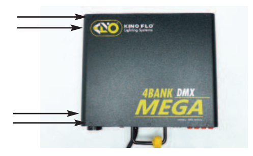
1) Remove ten (10) cover screws.

Mega 4Bank DMX Ballast (BAL-455-M120)is shown for illustration purposes.