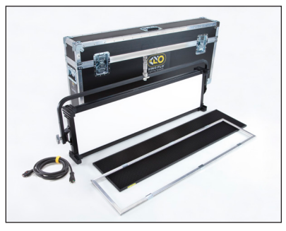
Celeb 401 Yoke Mount Kit