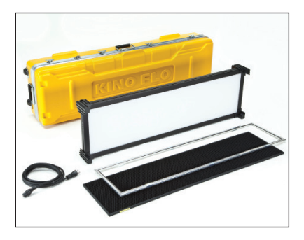
Celeb 401 Center Mount Kit