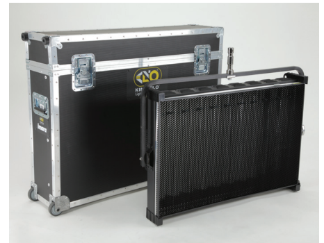
Imara S100 Kit