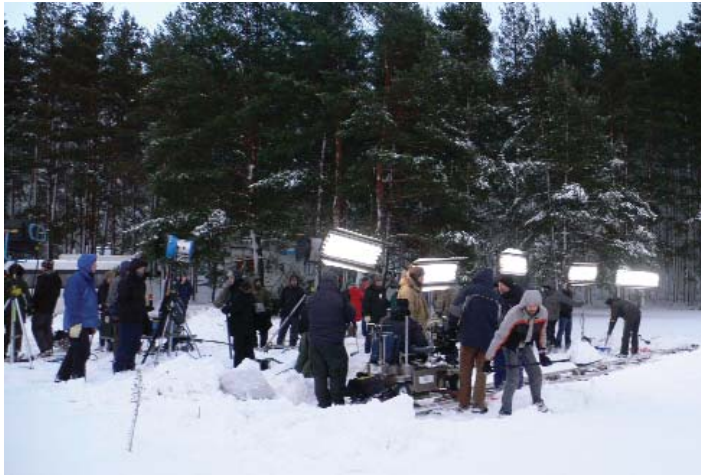
4bank systems, on location