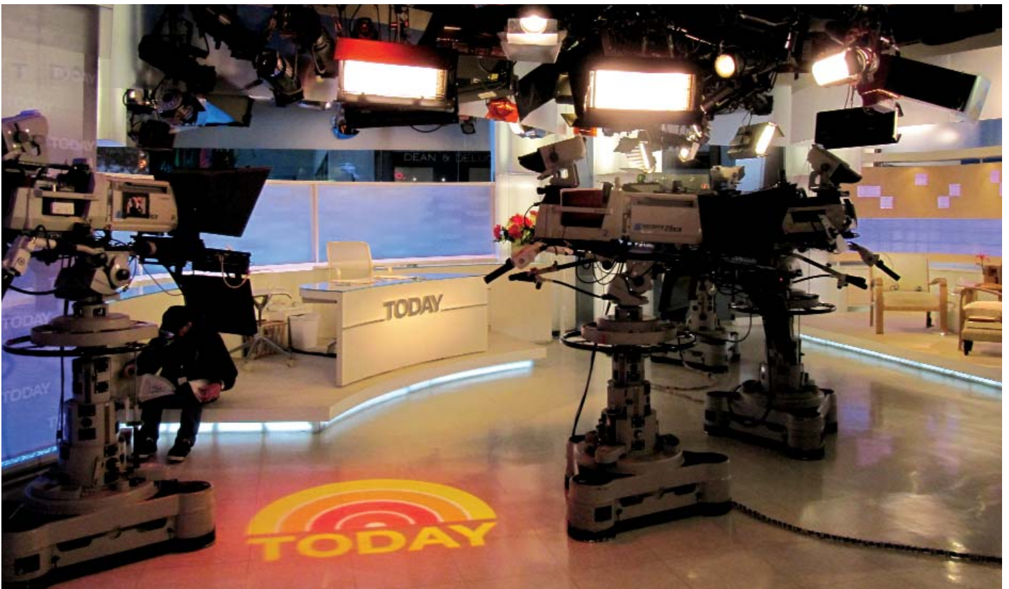
Diva-Lite® fixtures, TV broadcast studio