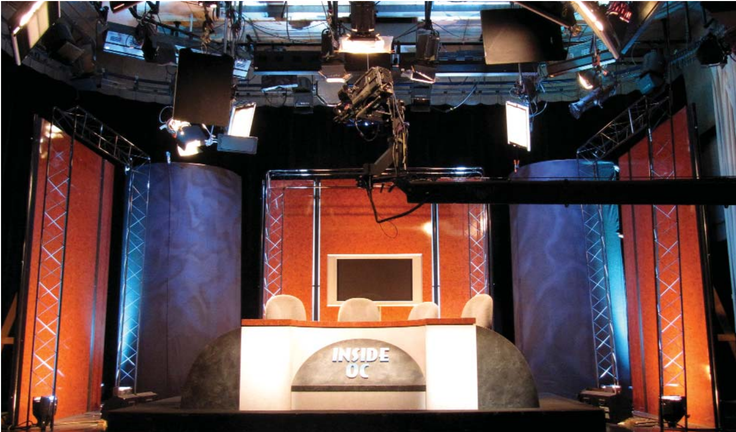
ParaBeam® fixtures, lighting public TV broadcast studio