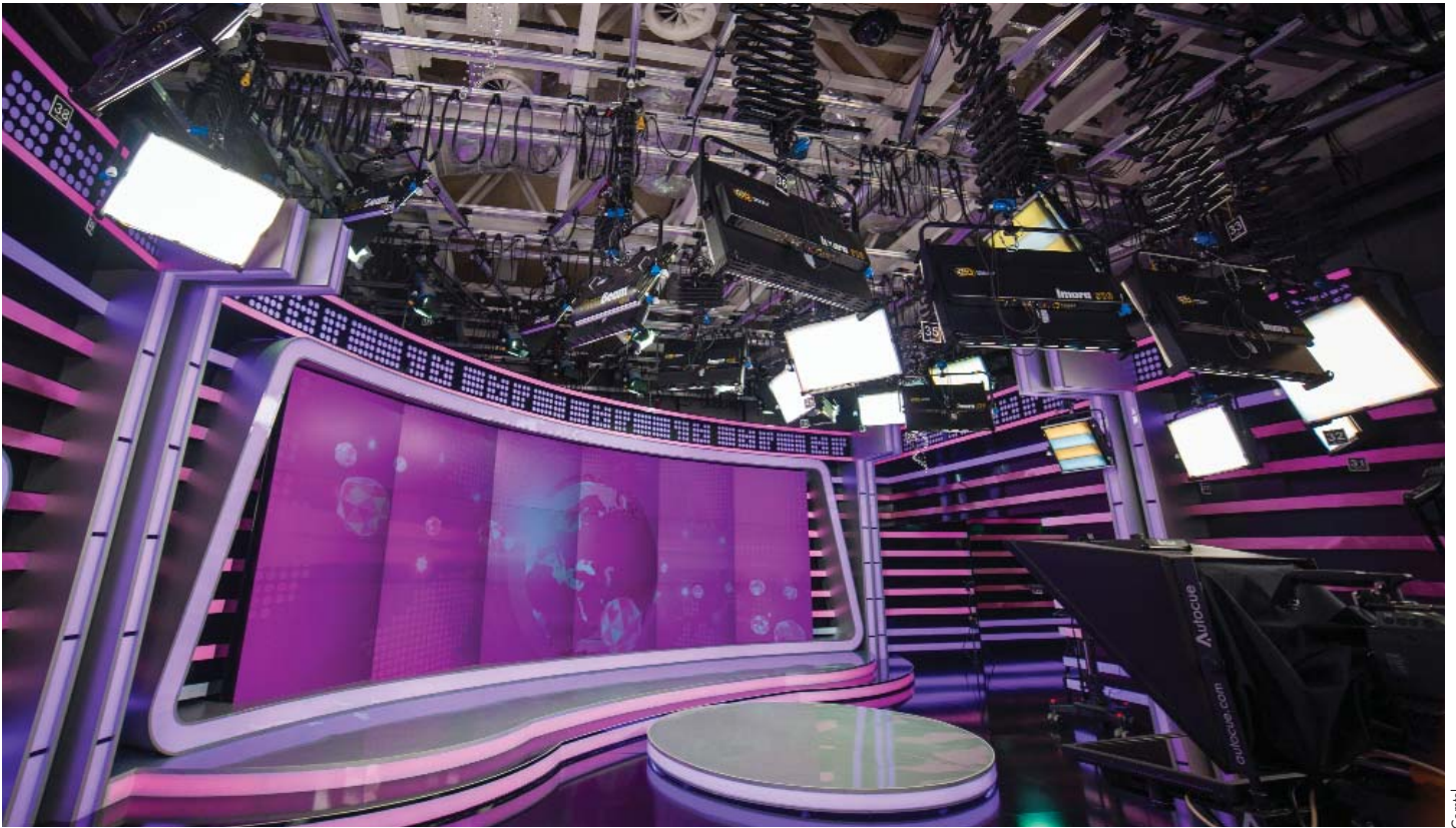
Imara® S10 and ParaBeam® fixtures, 1+1 TV broadcast studio