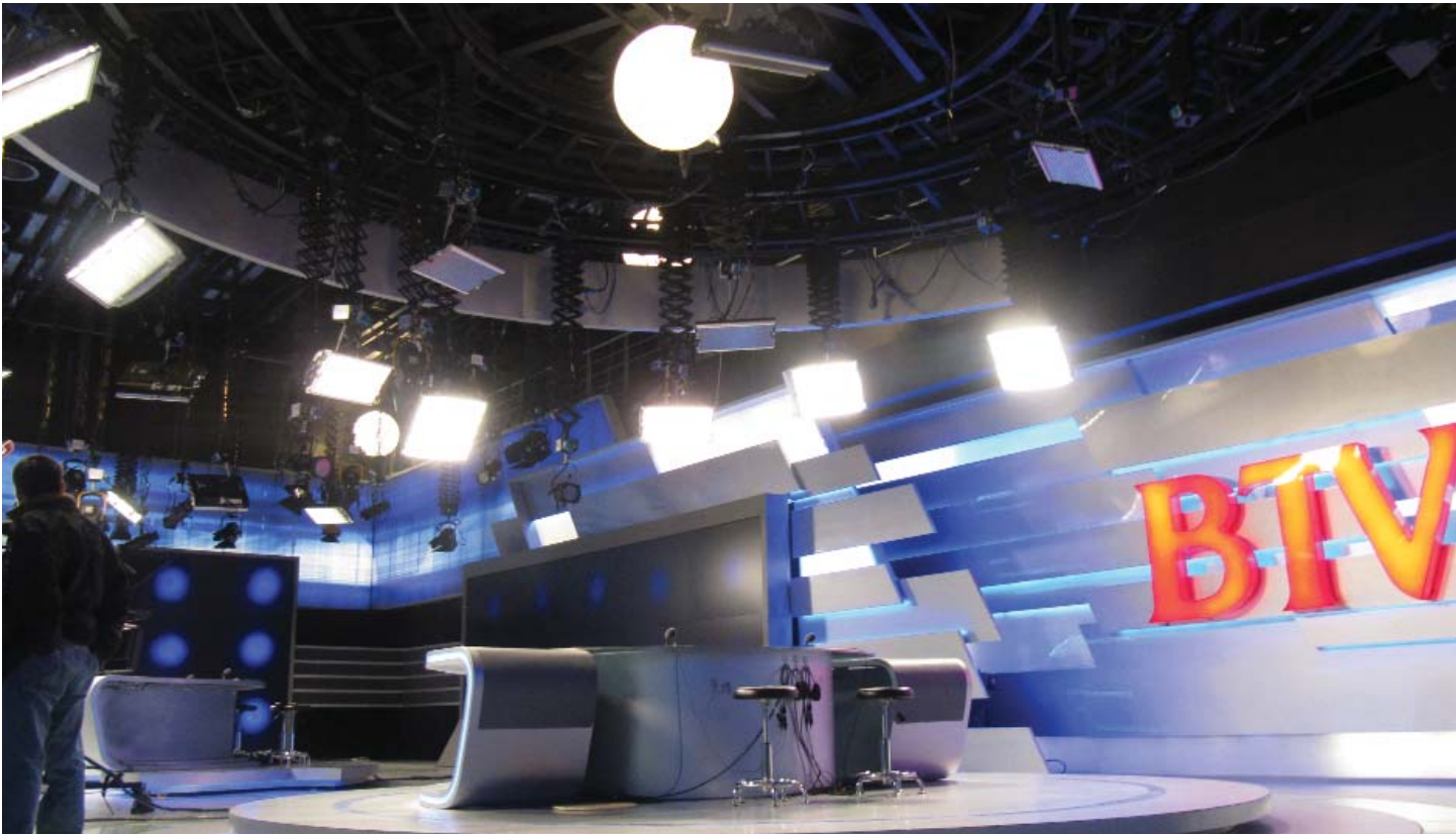
ParaBeam® fixtures, TV broadcast studio